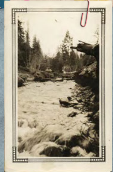
One Mile Creek at summer level 29th June, 1987

"Sun is shining. Weather is sweet. Make you wanna move your dancing feet." - Bob Marley