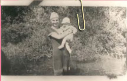
A teacher from Pemberton's initial school, the Spetch School, dressed in a traditional bathing suit from the early 1900s.

"Sun is shining. Weather is sweet. Make you wanna move your dancing feet." - Bob Marley