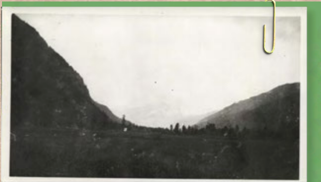
Ronayne Field and Barns "Summer Scene" July 6th, 1986

The sun is shining, the mountains are vibrant and green, the cottonwood has been falling like snow in July, and the traditional Pemberton Summer we all know and love has officially arrived! So what better way to honour this gorgeous season than to take a trip back in time to the summers of Pemberton's Past?