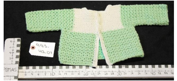
I am a Baby Jacket