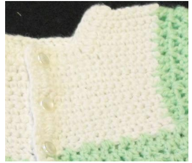
What am I?