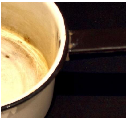
What am I?