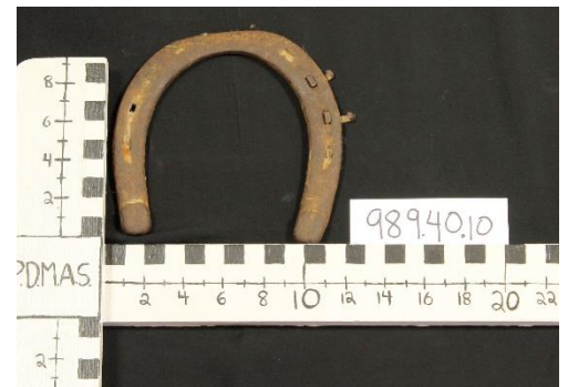
I am a Horseshoe