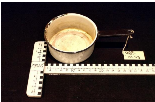
I am a Cooking Pot