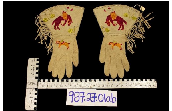
I am Leather Gloves