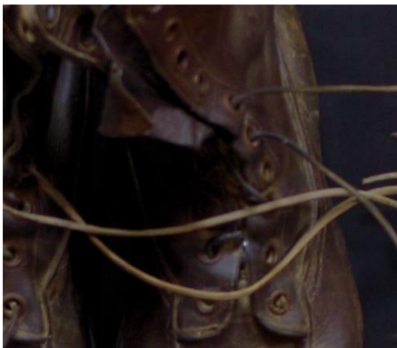
What am I?