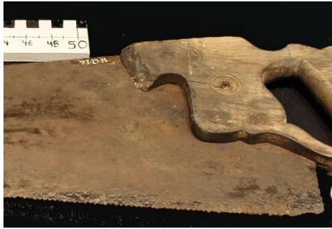
What am I?