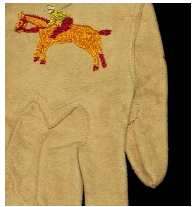
What am I?