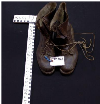
I am Work Boots