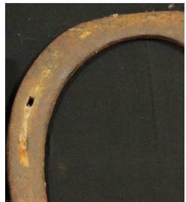
What am I?